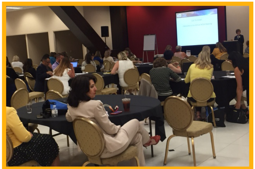
Members in attendance at the 2017 NCSA meeting in Las Vegas at the NCRA Convention